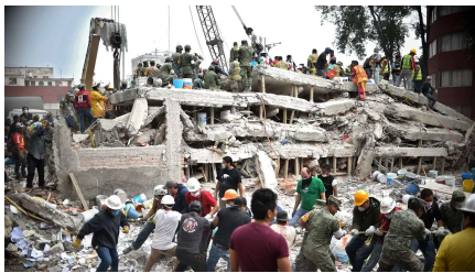
A building collapsed in Mexico

A magnitude 7.1 earthquake hit Mexico this week. It was the largest earthquake to hit Mexico in 100 years. There were 200 people who died and many buildings in Mexico City collapsed.