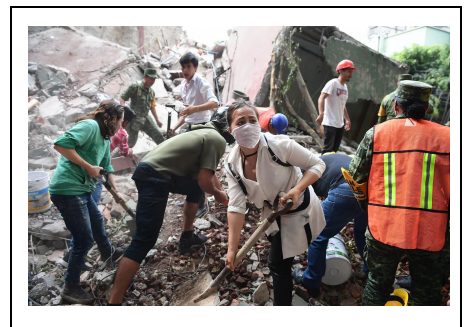
People helping in Mexico

I chose this story because I am worried about all of the people affected by these disasters. The other stories were cool, but they didn't talk about anything that affects people like this does. I have been hearing a lot about hurricanes in school, so I already knew some things about this story. Finally, this story seemed like the most important story to me.